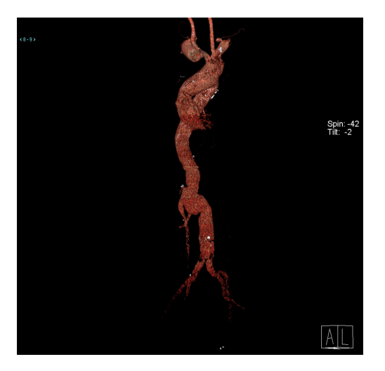
Figure 1 Reconstruction from a 5-year postoperative CT of a 35-year-old patient with Marfan syndrome and type A aortic dissection, who was submitted to multiple interventions for aortic valve-sparing, ascending-arch-descending-thoracoabdominal-abdominal aortic graft replacement. Of note, the native supra-aortic trunks and Carrel patch for visceral and renal reimplantation have dilated during follow-up.

*, myocardial complications include: acute myocardial infarction, myocardial ischemia, preoperative low output syndrome. IQR, interquartile range.