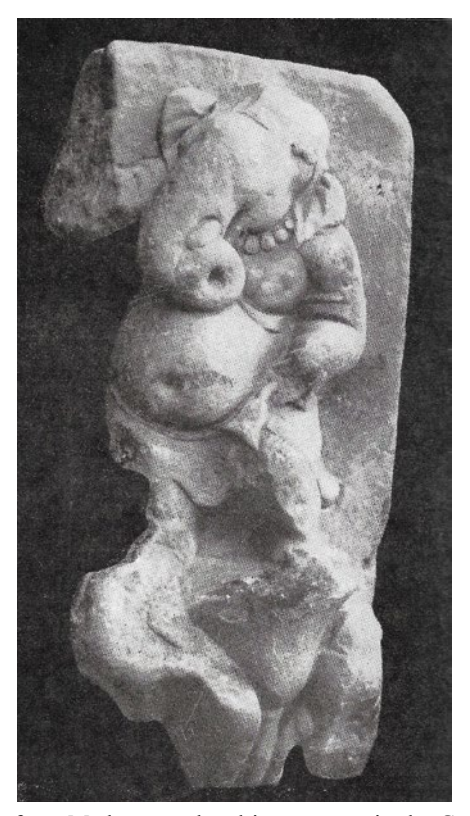
Fig. 1. Vināyakī from Mathura, sculpted image, now in the Government Museum of Mathura, early Gupta period, ca. 4<sup>th</sup> century. N° 509 (Photo: after Sharma 1979, Fig. 5), ABHINAV PUBLICATIONS DELHI.

The first currently known figurative representation of an elephant-faced deity dates from the 1<sup>st</sup> century BCE to 1<sup>st</sup> century CE and was excavated in Rairh near Jaipur (Puri 1941: 29, Pl. XIV, Fig. f). It is a small (height 8 cm) and very weathered terracotta plaque, but it most probably portrays a female figure standing facing frontwards. Her elephant head seems to be adorned with a towering headdress, her trunk is lying on her chest, slightly curled to her right. She is wearing a girdle and only has two arms; unfortunately, the hand attributes are no longer discernible. Notwithstanding the unskilled execution, this relief is noteworthy because it represents the earliest known depiction of an elephant-faced deity, and, significantly, it is a female deity.