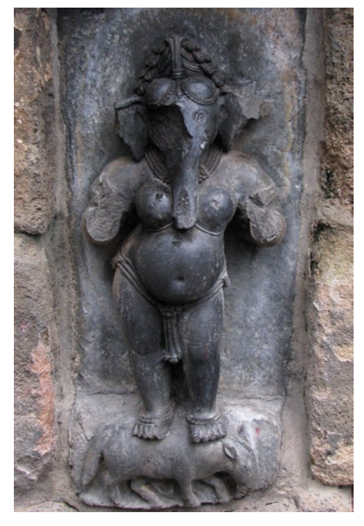
Fig. 4. Yogin\bar{\imath} n° 38, elephant-faced, Hirapur yogin\bar{\imath} temple, Odisha, second half of the 9<sup>th</sup> century (Photo: Chiara Policardi).