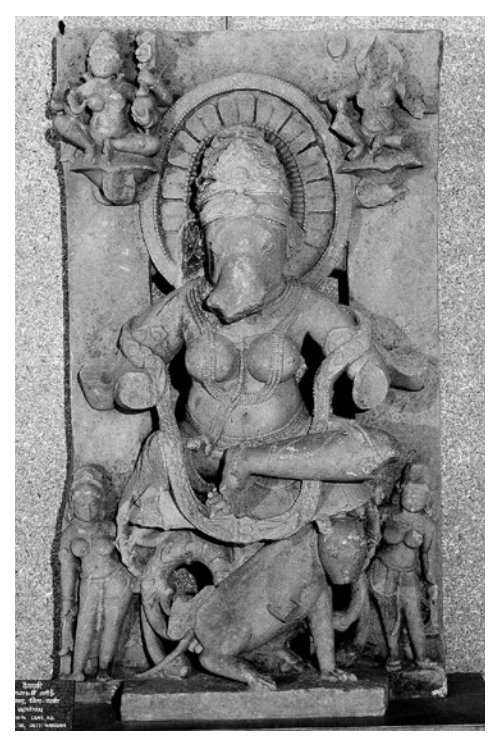
Fig. 8. Elephant-faced yoginī from Hinglajgadh, on the border between Madhya Pradesh and Rajasthan, middle of the 10<sup>th</sup> century. N° 209.

The elephant-faced yogin\bar{\imath} is represented seated on a full-blown lotus, with four female attendant figures flanking her, two along the base of the slab and two flying at its top. Her head, encircled by a petalled halo, is adorned by an elaborate crown, in the style of her richly bejewelled body. Both her trunk and her four arms are broken. Although the v\bar{a}hana is partly damaged, it is a prominent presence below the goddess's throne. It is likely a bandicoot, as some of the characterising features of the species are visible, namely the five nails, and the long, thin, and sparsely furred tail<sup>30</sup>. Its size is particularly conspicuous, and it is portrayed crouching on its hind legs, apparently with a chain around its neck.