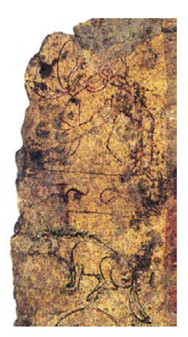
Fig. 2. Possibly elephant-faced goddess with a donkey vāhana , Dandan Oiliq, Buddhist temple CD4, eastern corridor.

2. MATHURA, fragmentary stone relief, now in the Government Museum of Mathura, Kuśāṇa period, ca. 2<sup>nd</sup> century CE. N° 33-2331 (Sharma 1979: Fig. 2; Panikkar 1997: Pl. 6).