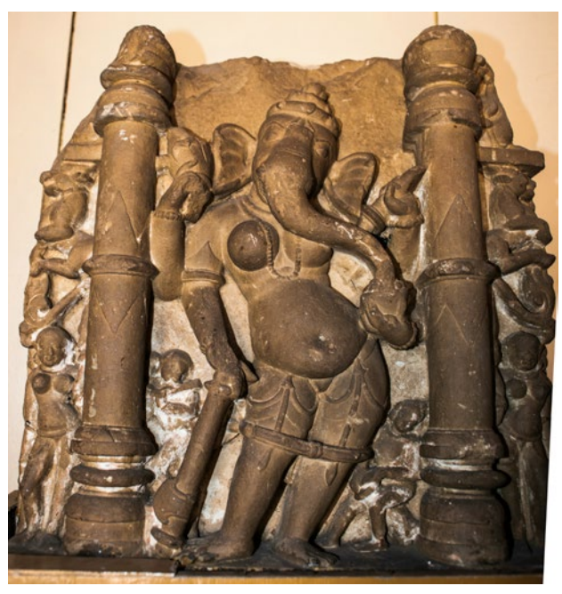
Fig. 7. Vināyakī, Suhania, Morena district, Madhya Pradesh, now in the Gujari Mahal Museum of Gwalior, ca. 10<sup>th</sup> century. N° 190.

upper right hand, while possibly a damaged dagger in her upper left. Her left normal hand holds a bowl of modakas , into which the curled end of her proboscis is dipping. Near her feet two small figures of male attendants are featured, a flute-player and a drumbeater, suggesting an atmosphere of music and dance, possibly alluded to also by the flexed bodily pose of the goddess. The image does not seem to belong to a yoginī temple, insofar as the style and the treatment of the sculpture do not resemble other known yoginī sculptures.