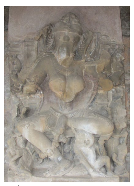
Fig. 9. Yoginī named Śrī Aingiṇī in the inscription, No. 41, elephant-faced, Bheraghat yoginī temple, near Jabalpur, Madhya Pradesh, last decades of the 10<sup>th</sup> century.