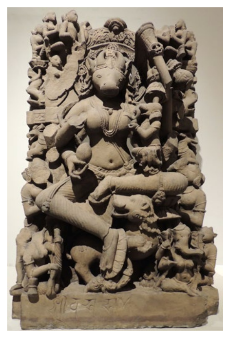
Fig. 10. Bull-faced yoginī from Shahdol, Madhya Pradesh, with elephant-faced child and female elephant-faced attendant, named Śrī Vasabha in the inscription, now in the Indian Museum of Kolkata, last quarter of the 11<sup>th</sup> century. N° A.25218.