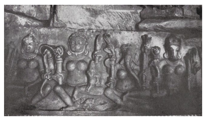
Fig. 3. Vināyakī with other yoginīs , from Rikhiyan, Banda district, Uttar Pradesh, ca. 10<sup>th</sup> century (Photo: after Sharma 1979, Fig. 9), ABHINAV PUBLICATIONS DELHI.