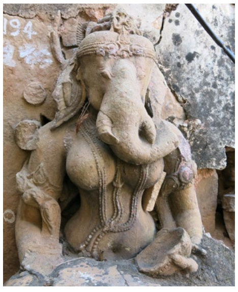
Fig. 6. Elephant-faced yoginī with wine cup, sculpture repurposed in a wall outside the Bhairava shrine, Harşa temple complex, Harshagiri, near Sikar, Rajasthan, ca. 9<sup>th</sup>-10<sup>th</sup> century.