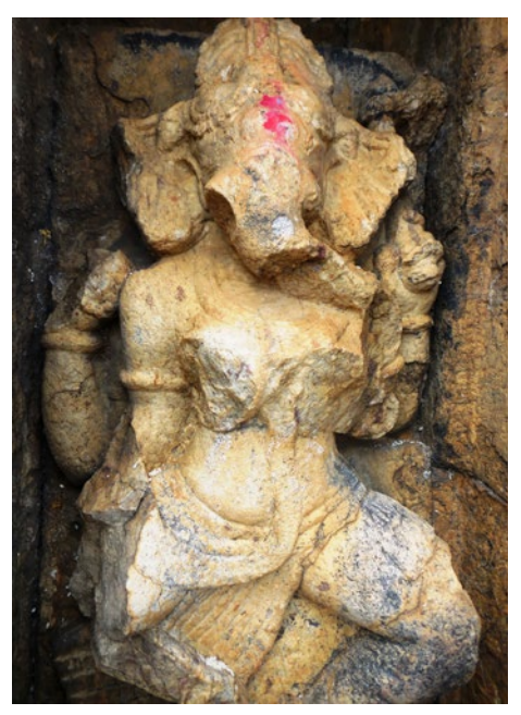
Fig. 5. Yoginī n° 22, elephant-faced, Ranipur-Jharial yoginī temple, Odisha, early 10<sup>th</sup> century (Photo: courtesy of Marialuisa Sales).