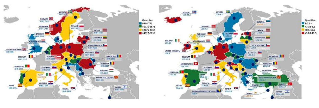
Figure 3 Number of heart failure-related hospital discharges per million people (left) and average length of stay in hospital primarily due to heart failure (right). Adapted from Seferović et al. <sup>13</sup>