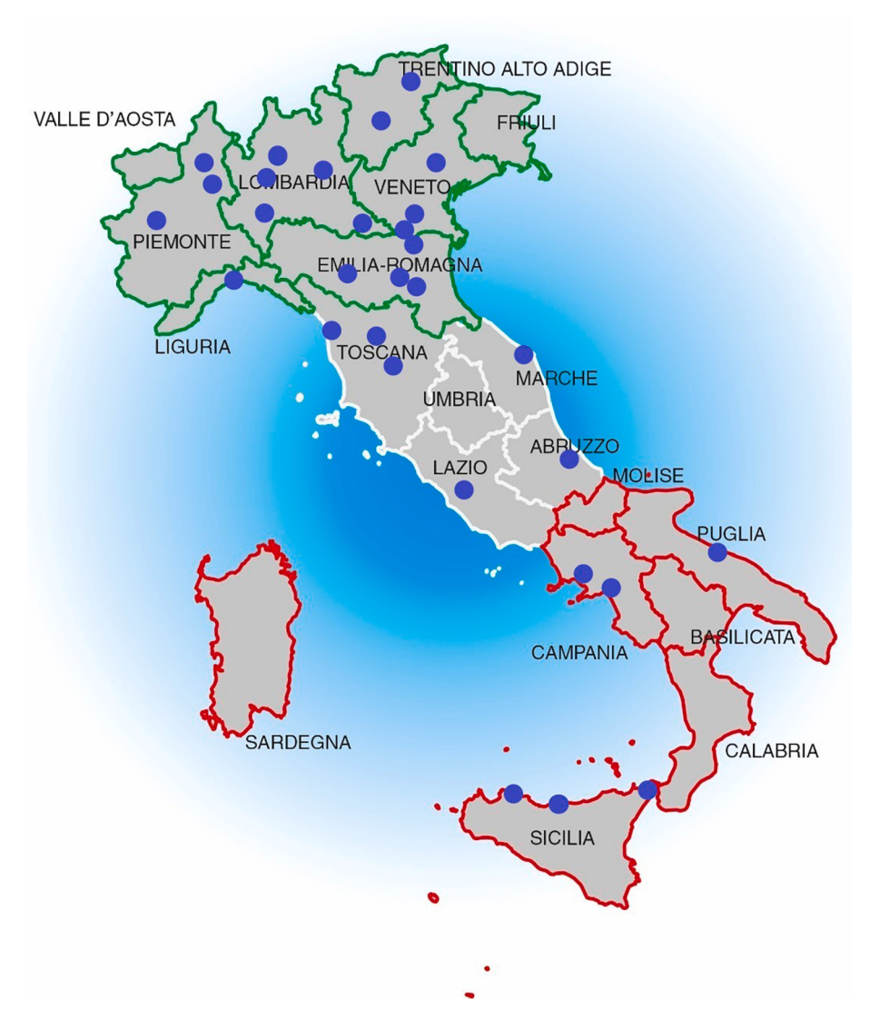
Fig. 1. The breakdown of the three Italian macro-regions. Northern regions are contoured in green, Central regions in white and Southern and Islands in red. Blue dots represents locations of participating centres. (For interpretation of the references to colour in this figure legend, the reader is referred to the web version of this article.)

A data collection form was designed by an international group of IAEA consultants in clinical cardiology and cardiac imaging and distributed in May and June 2020 through an online platform, designed by the IAEA and named International Research Integration System (IRIS) [4]. The questionnaire was conceived to collect general information about the healthcare facility; availability and use of personal protective equipment (PPE); strategic plans for reopening; changes in