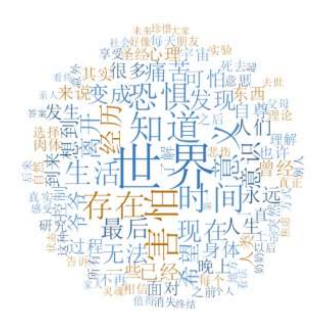
Figure 1. Word Cloud of Zhihu Answers (n= 115)

The perceptions of death as meaning reflections pervade the responses. Respondents reflected on the meaning of life to be "fulfillment of oneself because death is inevitable." Others interpreted the meaning of relationships through narrations about the death of loved ones and friends. Some explored the meaning of existence by stating that "death proofs that we have ever existed." The theme corresponds to Social Constructionist Model of Grieving where individuals generate and appropriate meaning through the grief of death.