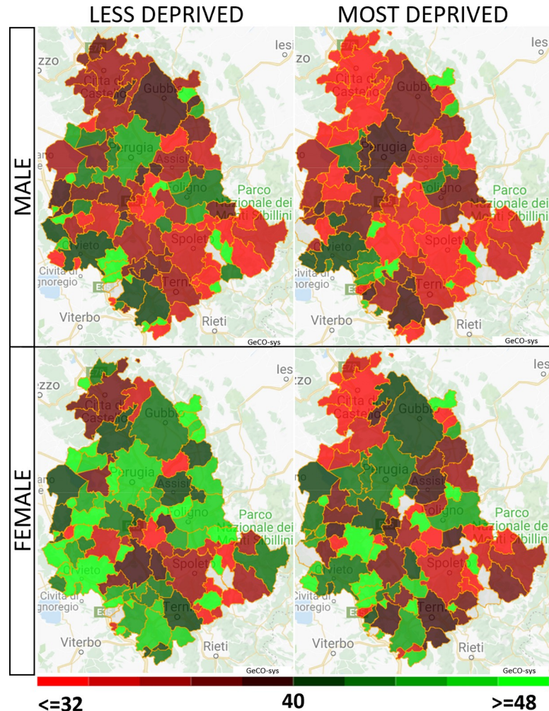
Fig 2. Regional screening adherence mapped as SARs by municipality, gender and extreme deprivation categories. Figure was created by the author Bianconi F. combing the caterpillar plots and maps generate with GeCO-sys an extension of [21].

https://doi.org/10.1371/journal.pone.0222396.g002