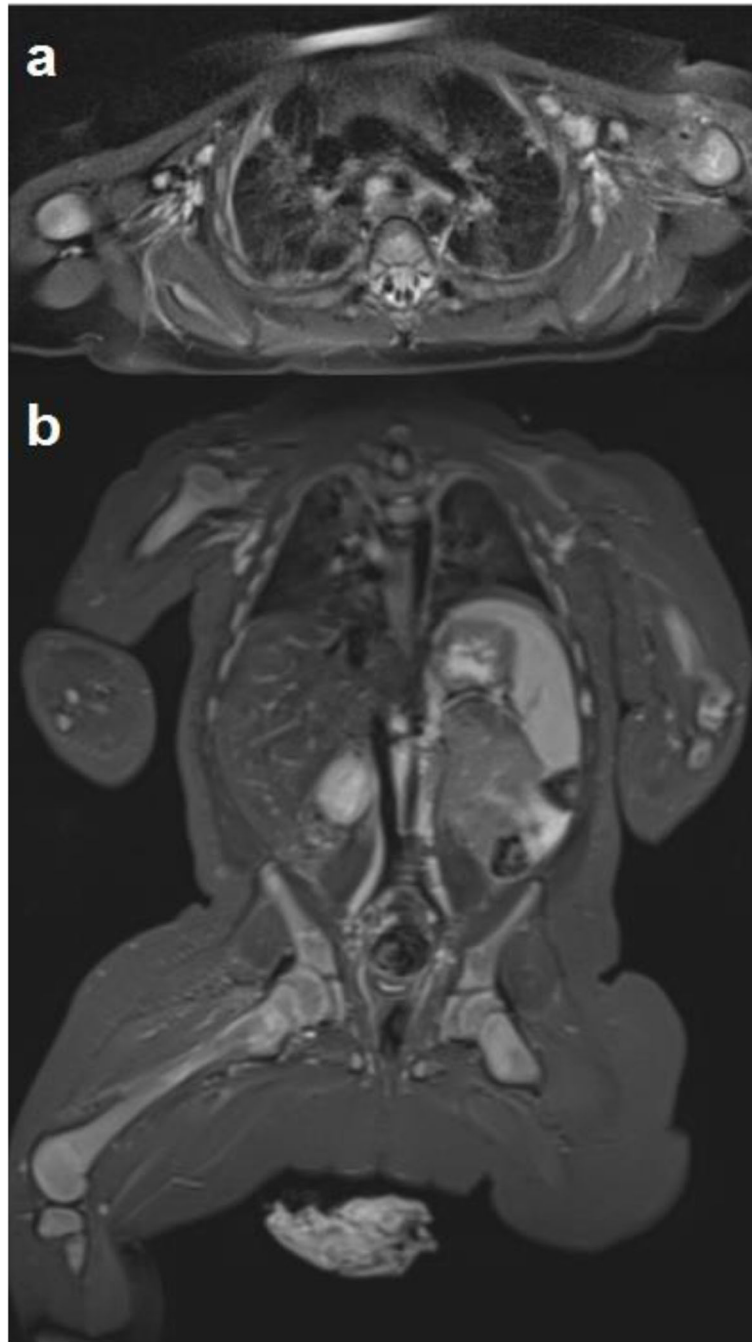
Fig. 2 a-axial and b-coronal STIR MR images performed about 1 month later showed complete resolution of muscular involvement and improvement of lungs and bone flogistic involvement

In our patient WB-MRI was really helpful for the detection and location of multifocal flogistic processes and was a valid and sensitive tool during the follow-up period, without radiation exposure of the child. Whole-body MRI is a fast and accurate modality for detection and monitoring of disease throughout the entire body with a variety of applications in the paediatric patient population [25].