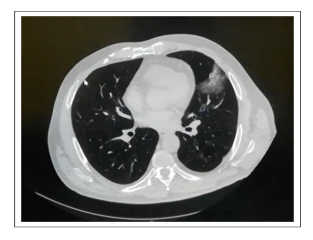
Figure 1. Thorax CT scan: left apical interstitial pneumonia.