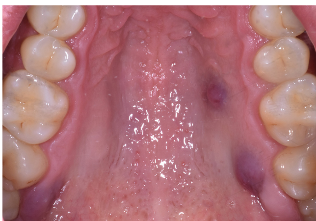
Fig. 1. Occlusal view of three painless, red-purplish, papular and nodular lesions of the hard-palate mucosa.

The therapeutic approach could range from surgical excision to radiotherapy, local or systemic chemotherapy and potential related side effects should be considered during the therapeutic selection [1-3]. Systemic chemotherapy is indicated just in cases of advanced disease and it's often associated with severe adverse effects as myelosuppression, opportunistic infections, alopecia, gastrointestinal toxicity and peripheral neuropathy [1]. Oral KS has been demonstrated to be highly responsive to radiotherapy, which may give, unfortunately, important side-effects such as severe mucositis, pain, dysgeusia and hyposalivation [1]. Intralesional injections of vinblastine, have been effective for local treatment of mucocutaneous lesions, but the procedure is painful and associated with the potential risk of necrosis and ulceration of the surrounding healthy tissues [1]. Isolated and superficial mucocutaneous lesions are susceptible to surgical excision, while diffuse or multifocal KS are not suitable for this option due to potential functional impairment of the tissues and