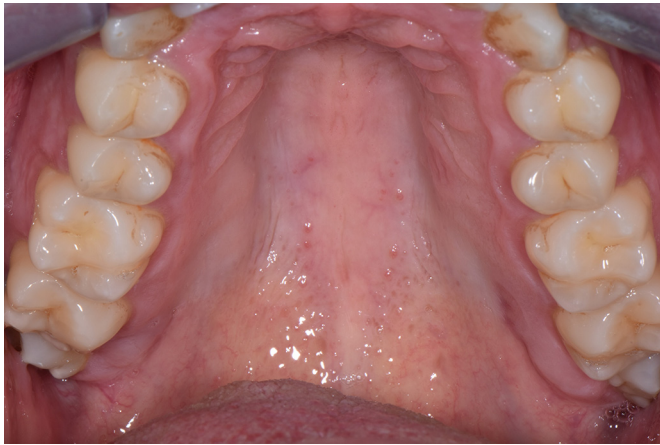
Fig. 3. Complete healing and absence of recurrence at 6-months follow-up.

development of multiple scars [1–3]. In case of isolated oral lesions with no widespread involvement, surgical excision and CO 2 laser ablation have proven to be effective treatment options which may lead to complete resolution of the disease [1,2].