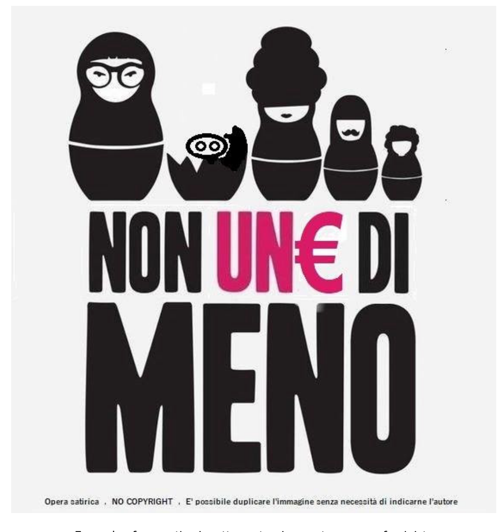
Example of sarcastic vignette portraying contemporary feminists 47x49mm (300 \times 300 DPI)