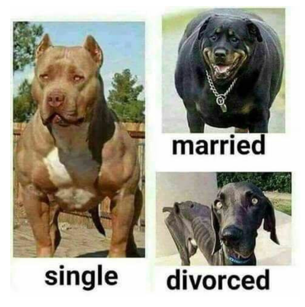
Vignette representing divorced women's greediness 40x40mm (300 \times 300 DPI)