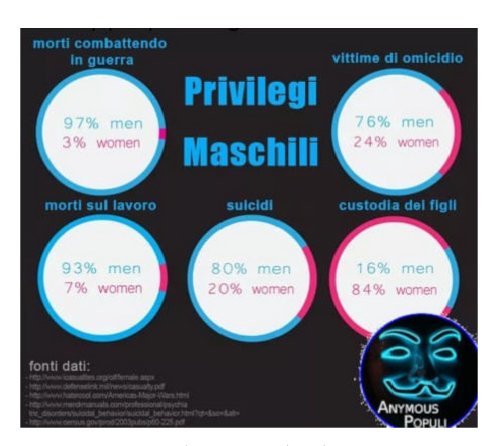
Ironical vignette on men's privileges 38x33mm (300 x 300 DPI)