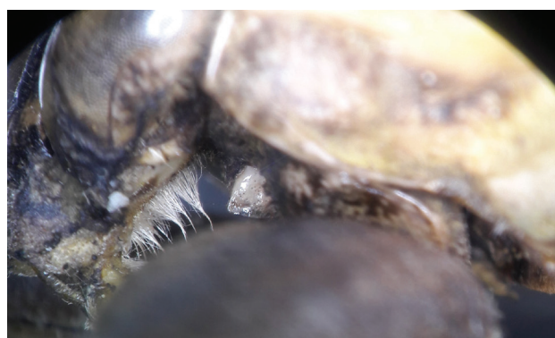
Fig. 4 – Prosternal bearing-shaped keel of the Lethocerus cf. patruelis individual from Prunella. The apex is missing due to damage to the specimen.

if its apical “beak” is lost, probably due to the crushing of the specimen), instead of an “ulu-shaped” keel, as in L. patruelis (Fig. 4).