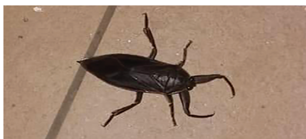
Fig. 2 – Lethocerus cf. patruelis specimen (alive on the ground) photographed by Mr. D. Nicoletti in Villapiana (Cosenza province), on 11 Nov 2018.

Lethocerus patruelis record could suggest the same specific identity. Since there is no ventral picture of the specimen, it was not possible to determine its sex.