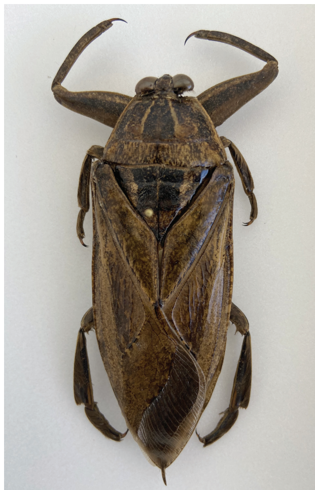
Fig. 3 – Lethocerus cf. patruelis , ♀ individual from Prunella (Melito Porto Salvo municipality), dorsal view.

It should be noted that this specimen exhibits a morphological character which, according to the key proposed by Novoselsky et al. (2018), is more compatible with L. cordofanus than with L. patruelis : its prosternum shows a bearing-shaped keel as in L. cordofanus (evident even