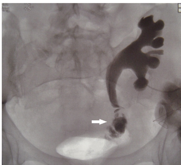
Fig. 3 Nephrostogram demonstrating urinary leakage at the site of the ureteral reimplantation (arrow)

Written informed consent for publication of this Case report and any accompanying images has been obtained from the patient. A copy of the written consent is available for review by the Editor of this journal.