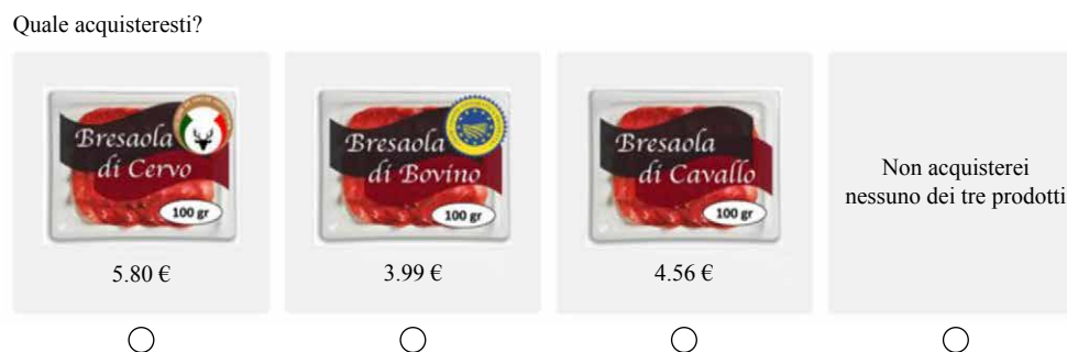
Figure 1. Example of a choice task. The question is translated from the Italian in 'which would you choose?'. The alternative 'Bresaola di Cervo' is the red deer bresaola, the alternative 'Bresaola di Bovino' is the bovine bresaola, the alternative 'Bresaola di Cavallo' is the horse bresaola, while the alternative 'Non acquisterei nessuno dei tre prodotti' is the 'no-buy' option.