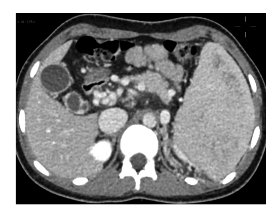
Figure 1 Axial computed tomography. Portal cavernoma, enlarged spleen, and large varices.