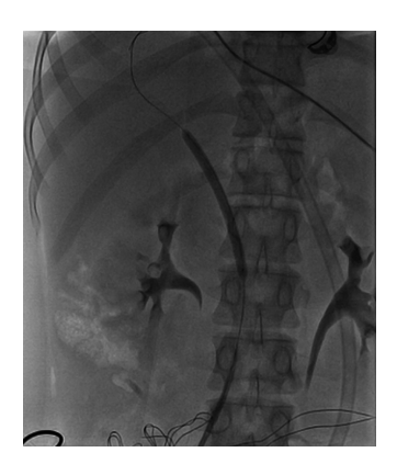
Figure 3 Minilaparotomy-assisted transmesenteric pre-dilation with 0.018' guide wire inserted 8 mm into the portal trunk after portal cavernoma recanalization with hydrophilic guide wire.

One month later, massive upper gastrointestinal bleeding re-occurred and her hemoglobin level decreased from 12.4 to 8.4 g/dL. Considering the patient's history and the number of bleeding episodes over a short period of time, the indication for a portosystemic shunt was discussed. The multidisciplinary team, including pediatric surgeons, interventional radiologists, and pediatric gastroenterologists agreed upon the choice to perform a portal vein recanalization through ileocolic vein isolation with a MAT approach, followed by transjugular intrahepatic portosystemic shunt (TIPS) during the same session. In the case of failed portal recanalization, this approach, would also be useful for varice endovascular embolization and serve as a bridge for a delayed mesorex procedure<sup>[10]</sup>. Prior to the