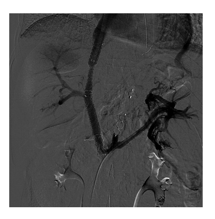
Figure 5 Follow-up angiography. Hepatopetal flow in the right portal branch. Hourglass shape of the under-dilated transjugular intrahepatic portosystemic shunt. Free fluid around the liver (before removal with suction and sponges).

Postoperative recovery was uneventful. No blood transfusion was necessary. No encephalopathy episodes were observed. The girl was discharged 15 d after the surgery. Therapy consisting of propranolol and a proton