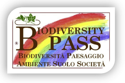
Fig. 1. Biodiversity logo used in the CE.

The quality level in tasting simulates quality at taste judged by expert sommeliers according to the Gambero Rosso wine