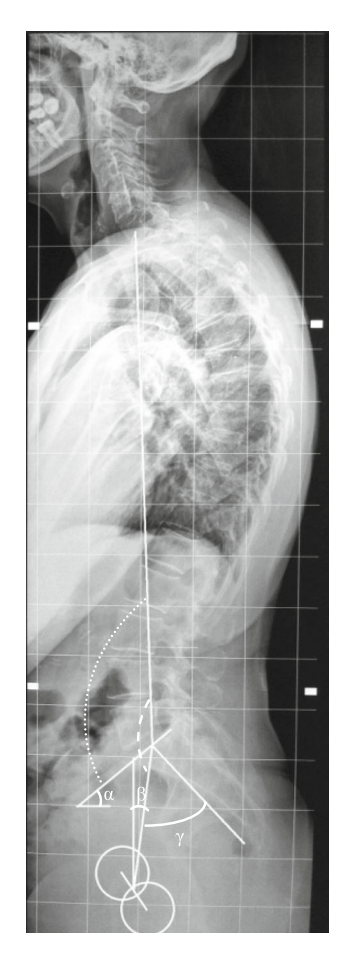
Fig. 1 Main parameters of spinal alignment measured in the study: dotted line spinopelvic angle (SPA), broken line spinosacral angle (SSA), \alpha sacral slope, \beta pelvic tilt, \gamma pelvic incidence