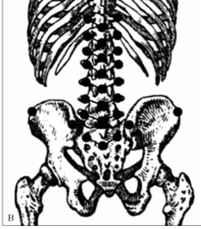
Figure 2.—The position of the markers (A) and the corresponding biomechanical model on the skeleton (B).

During the data acquisition protocol, the subject was asked to perform free movements in the sagittal, frontal and horizontal planes: flexion, extension, left and right lateral bending, left and right axial rotation from standing to the maximum excur-