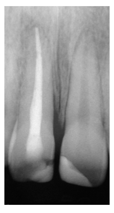
Figure 5. Rx at the 3-month recall visit.

crown, and an anterior open bite, the patient was encouraged to undergo a comprehensive treatment that he previously always avoided.