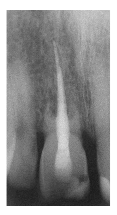
Figure 8. Rx at the 7-year recall visit.