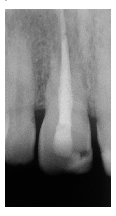
Figure 6. Rx at the 2-year recall visit.