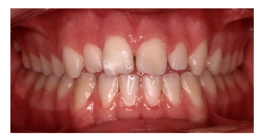
Figure 4. Intraoral view when the splint was removed (three weeks after injury).

The splint was removed 3 weeks later and the fractured crown of tooth 21 was restored with composite resin (Figure 4).