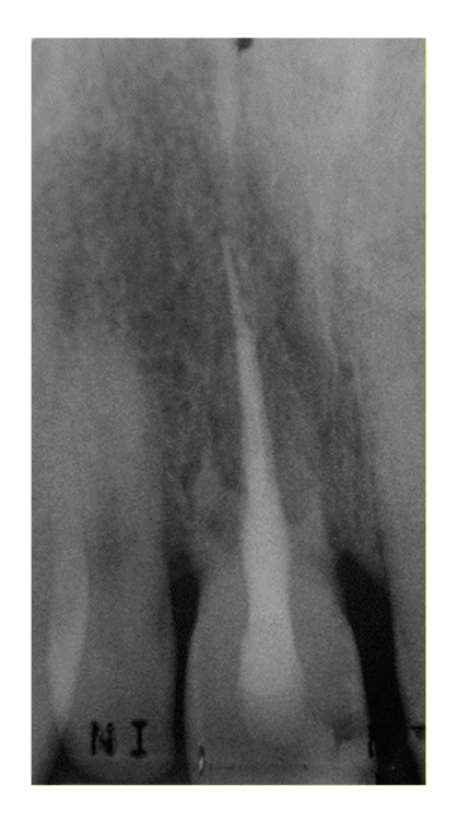
Figure 9. Rx at the 10-year recall visit.

Finally, 16 years after the trauma (Figures 10 and 11) the patient was scheduled for an orthodontic and implanto-prosthetic rehabilitation.