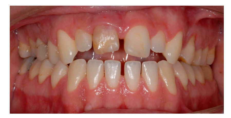
Figure 11. Intraoral view 16 years after delayed replantation of tooth 11.