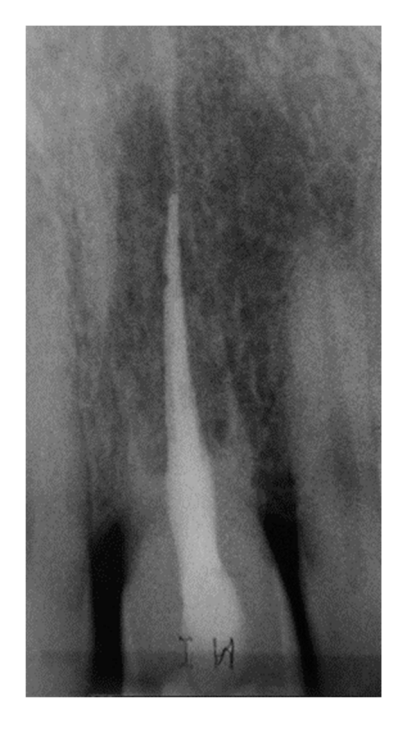
Figure 7. Rx at the 4-year recall visit.