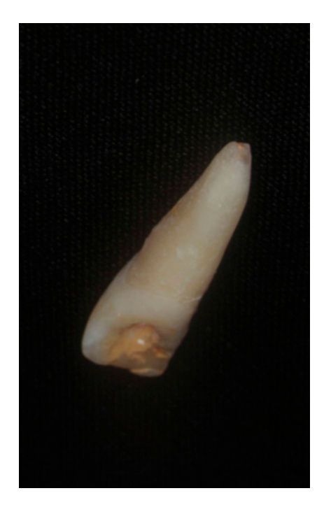
Figure 2. Tooth 11 after root planing, pulpectomy, and filling with gutta-percha and sealer.

The fragment of tooth 21 was discovered inside the swollen and lacerated upper lip. No other oral injury was detected clinically. Examination of the avulsed tooth showed an uncomplicated crown fracture and necrotic periodontal ligament cells due to the prolonged dry storage. After the parents' informed consent, the root of the avulsed tooth was planed to remove the necrotic periodontal tissue, and was then filled with gutta-percha and sealer after pulpectomy (Figure 2).