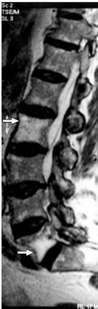
Figure 1 Sagittal MR scan of the spine showing vertebral infiltration, being most intense in L2 and L5, which is biconcave (arrows).

He had a past history of epilepsy, which was controlled by phenytoin and phenobarbitone. In 1993 he was admitted with abdominal pain, splenomegaly, and pancytopenia; this was diagnosed as low grade B cell lymphoma and hypersplenism. Splenectomy was performed in 1994, his blood count returned to normal, and repeated full blood counts were