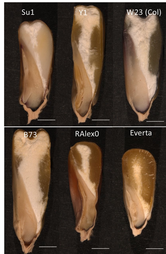
Fig. 2 Sectioned wild-type kernels. In the sectioned kernels, the vitreous region appears lucid and darker, while the floury region is white and opaque (white bar: 3 mm in length)

An additional analysis was performed by comparing the data obtained from the three different genetic lines among themselves, without considering the homozygous mutant seeds. In this comparison, we include three additional