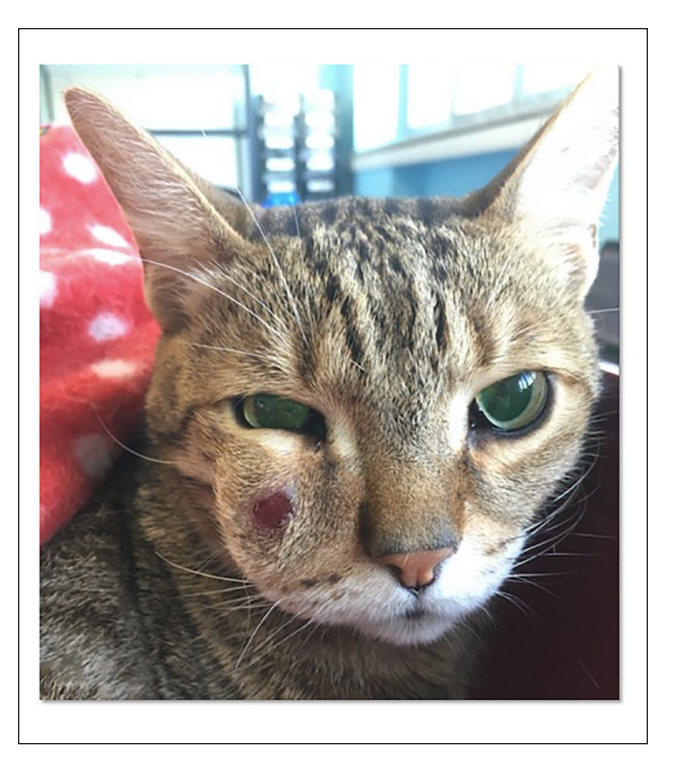
Figure 1 The patient at the time of presentation. The mass extends from the upper portion of the right lip towards the right ventral eyelid

Cytological findings were consistent with a mesenchymal neoplasia; therefore, a contrast-enhanced CT scan of the head, thorax and abdomen was performed for surgical planning and to rule out metastatic disease.