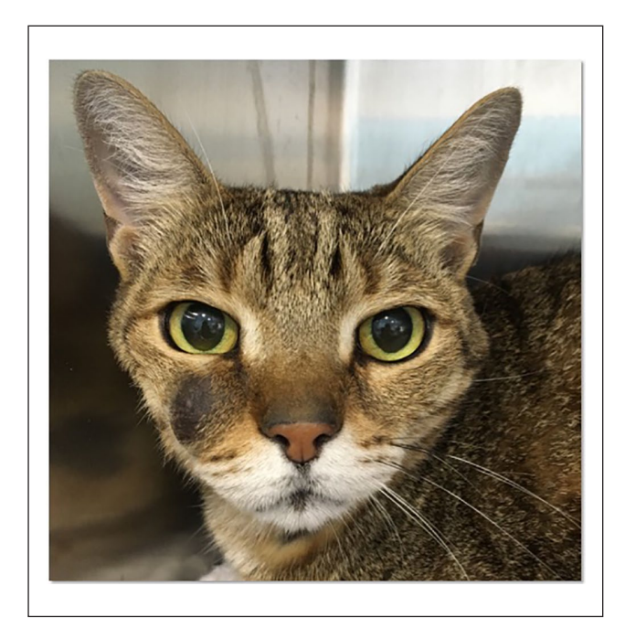
Figure 3 The patient after three treatments with doxorubicin. The mass has reduced by 39% of its original volume and there is a lesser extension towards the right eye and surrounding structures