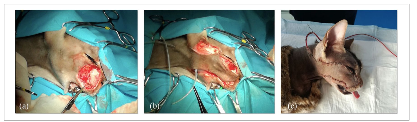
Figure 4 Intraoperative picture. The tumour was (a) excised and (b) a single advancement flap was created to correct the surgical defect. (c) At the end of the procedure, a closed suction drain was positioned before wound closure