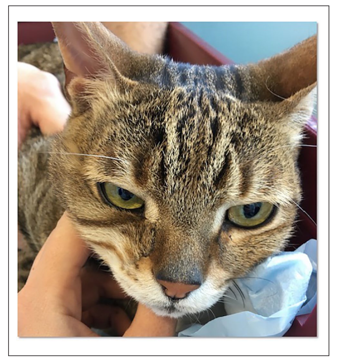
Figure 6 The patient at the time of follow-up, 170 days following surgery. The wound is healed and there is an acceptable cosmetic appearance There are no signs of local tumour recurrence

Adjuvant doxorubicin was started 20 days after surgery. Three total treatments were administered every three weeks at a dose of 25 mg/m<sup>2</sup> as a slow IV infusion, following administration of maropitant at 1 mg/kg IV. Adjuvant chemotherapy was overall well tolerated: a sporadic, self-limiting VCOG grade I GI toxicity (nausea