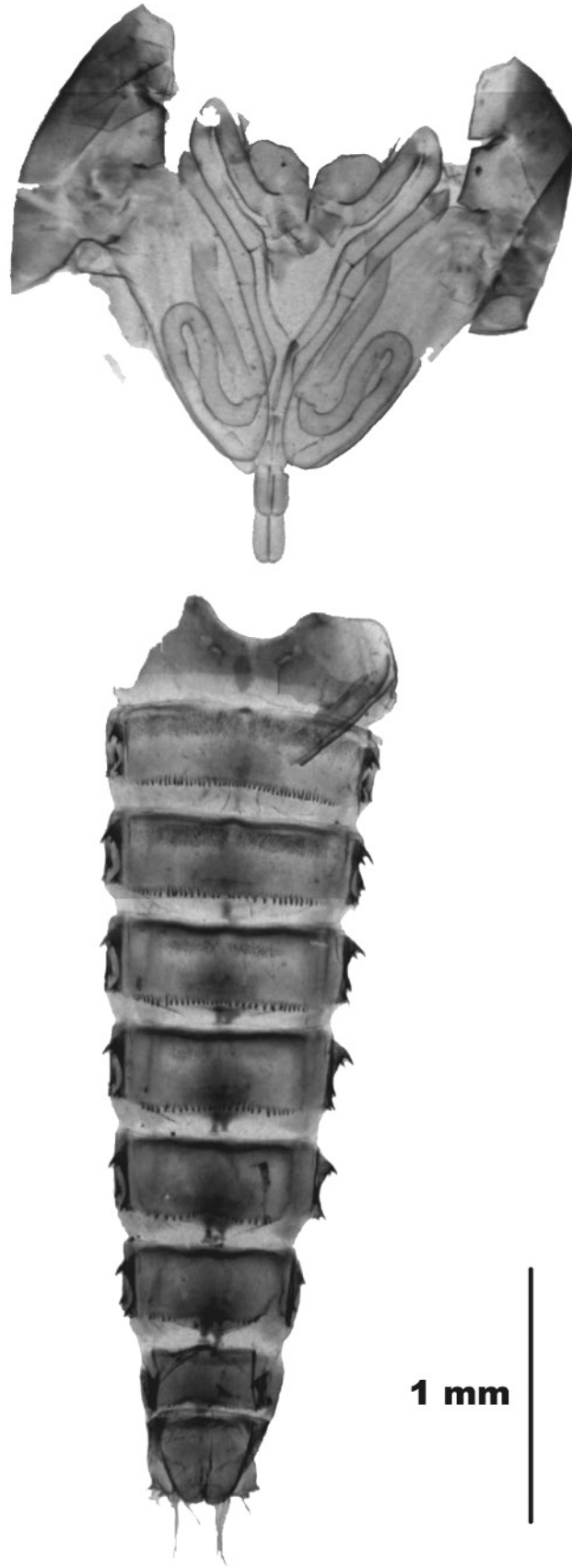
Fig. 3 – Slide mounted pupal exuviae of B. thienemanni collected in the Adda river (Comazzo) on 26/VI/2002.