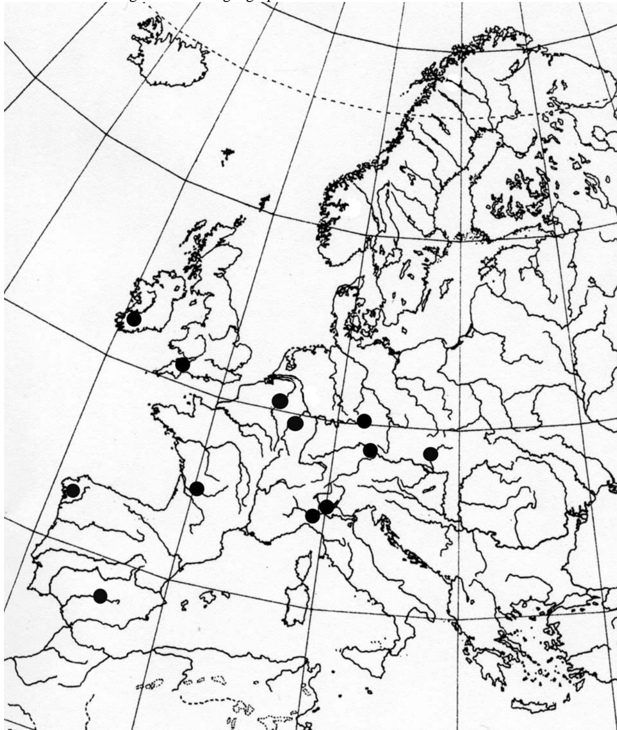
Fig. 1 - Revised geographical distribution of B. thienemanni .