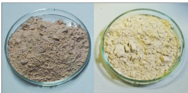
Fig. 1 – Appearance of the powders of Ben (left) and Zeo (right) materials.

a. Metal composition is expressed as metal oxide (expressed as wt.% over the dried form of the samples); b. obtained by C,H,N elemental analysis; c. not determined; d. with 97% of the particles below 53 μm; e. determined by Brunauer-Emmett-Teller equation; f. specific surface area for Cu-Ben = 121 m 2 /g; g. cation exchange capacity according to the ammonium acetate method.