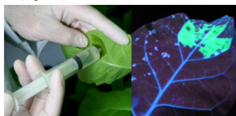
Figure 2 Schematic illustration of expression of transgene in plants. Left panel: infiltration of Agrobacterium carrying the GFP transgene; right panel: visualization of transient expression of the fluorescent protein four days post infiltration examined under a UV lamp. 4

The use of engineered plants as “bioreactors” for the production of high-value recombinant proteins for industrial and clinical applications has become a promising alternative tool to the conventional bio-production systems, such as bacteria, yeast, and cultured insects and animal cells (Figure 2). 3