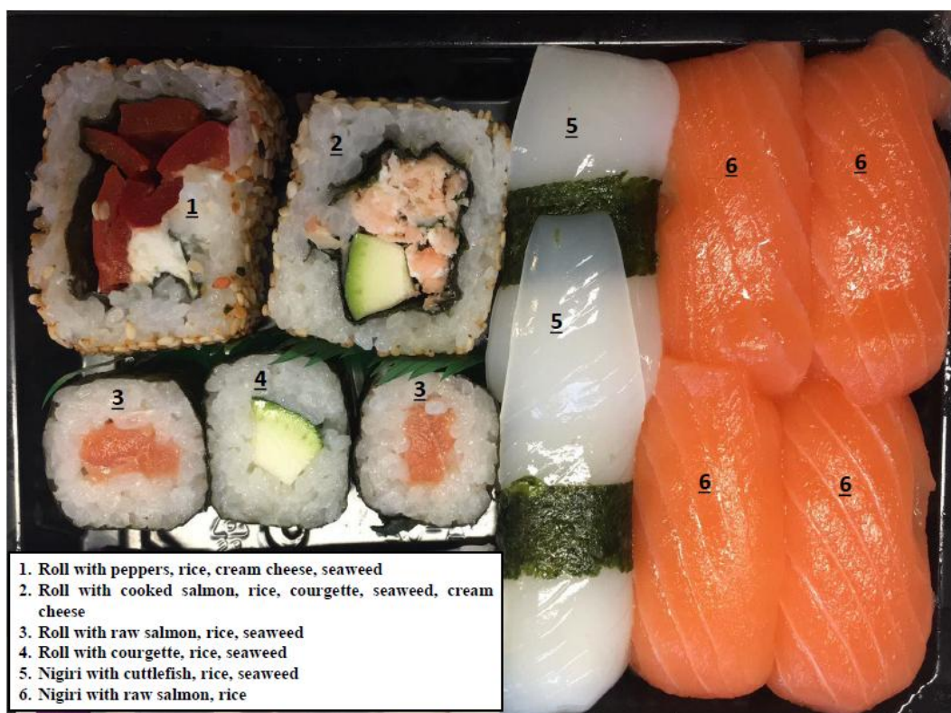
Figure 1. Typology of sushi analysed and ingredients

All the samples were stored 2 hours at 12°C, then maintained at 8°C and sampled after a total of 24, 48, 72 96 hours from the production. Microbiological samples were analysed in triplicate for the parameters reported in section 2.4 and for sensorial properties; a total number of 36 samples were processed.