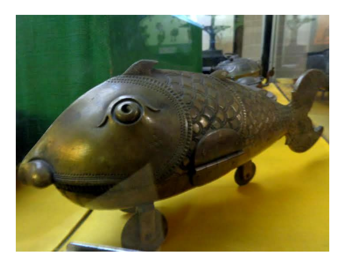
Fig. 2. Betel box, brass, 18th–19th century, from Hyderabad, Andhra Pradesh, Raja Dinkar Kelkar Museum, Pune, India.