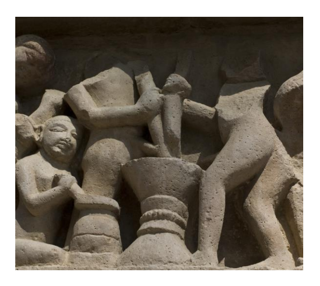
Fig. 8. Detail of Fig. 7: three naked Jain monks cooking in the centre of the orgy frieze.