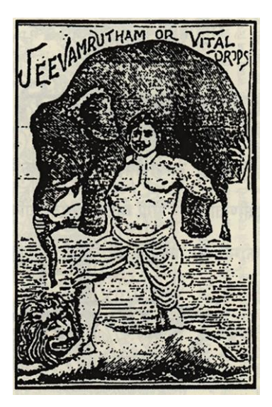
Fig. 3. Aphrodisiac advertisement in Allahabad Leader , 8th Jan. 1911, showing sexually strong man (from Gupta 2002, 76).