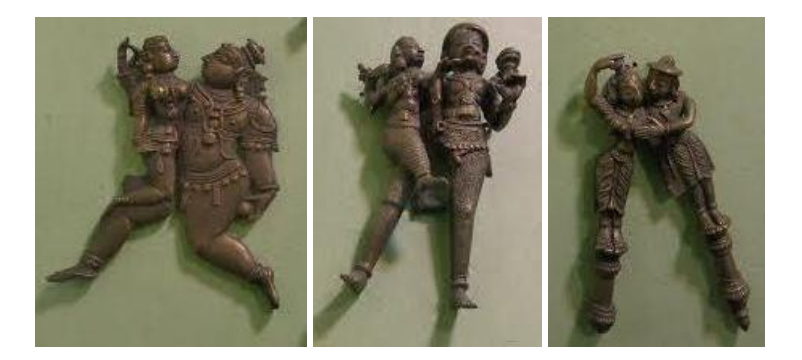
Fig. 3. Areca fruit cutters, brass, 18th–19th century, from Gujarat and Maharasthra, Raja Dinkar Kelkar Museum, Pune, India.