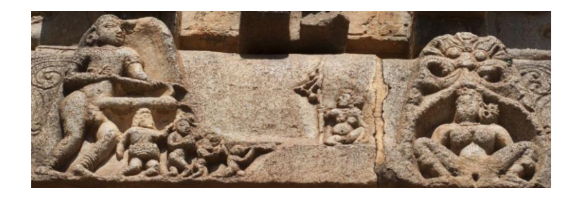
Fig. 6. Relief sculpture from south wall of śikhara , Kalleshvara temple (12<sup>th</sup> century), Bagali, Davangere District, Karnataka.