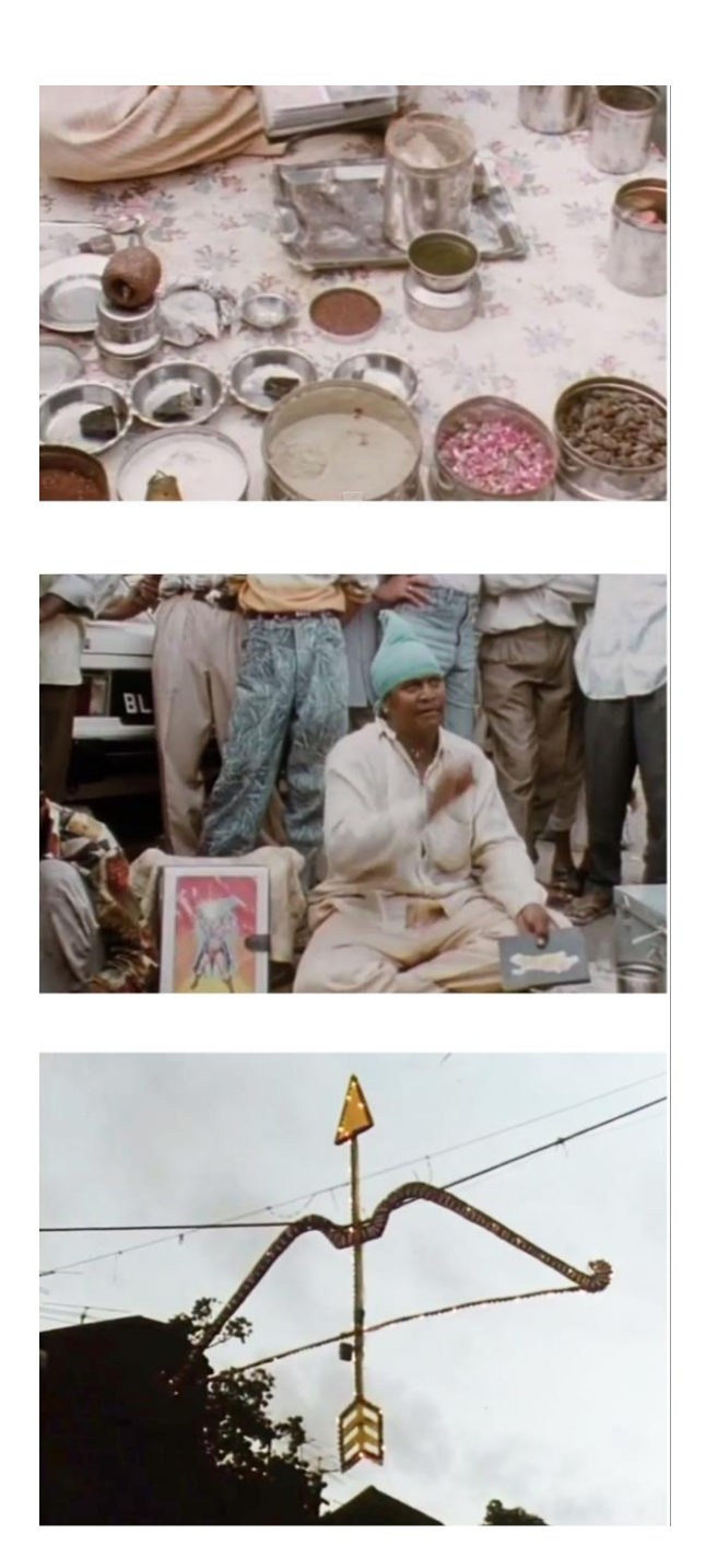
Fig. 5. Stills from Father, Son and Holy War, dir. Anand Patwardhan 1995; Part 2: Hero Pharmacy; from above, a, b, c (courtesy Anand Patwardhan).