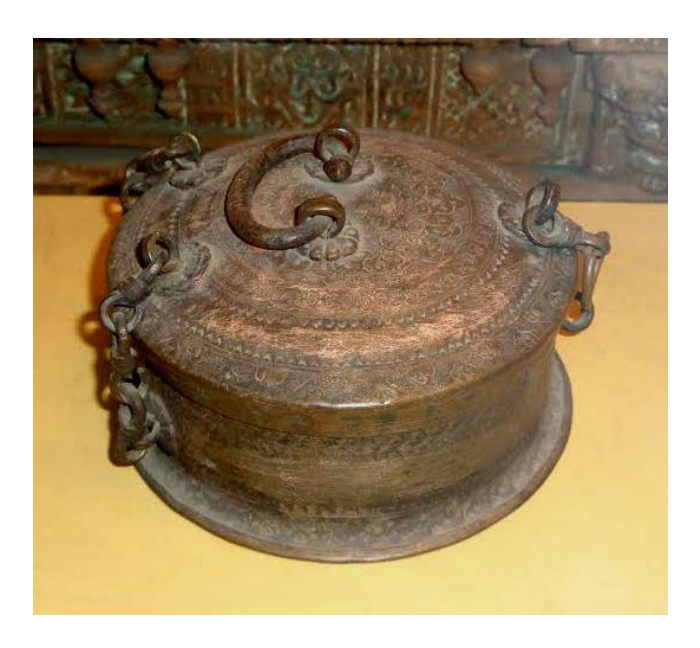
Fig. 1. Betel box, copper and brass, 18th century, from Gujarat, Raja Dinkar Kelkar Museum, Pune, India (photo T. Szurlej).