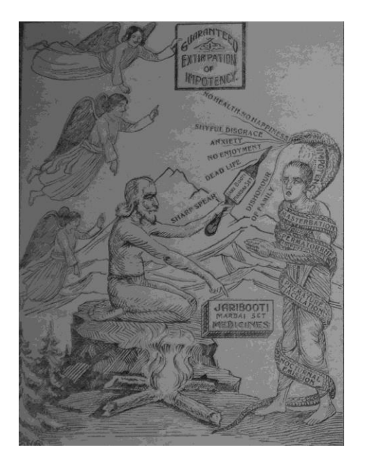
Fig. 2. Aphrodisiac advertisement in Mumbai Samachar, 6th Jan. 1928, showing an ascetic providing cure for a sexually weak youth.