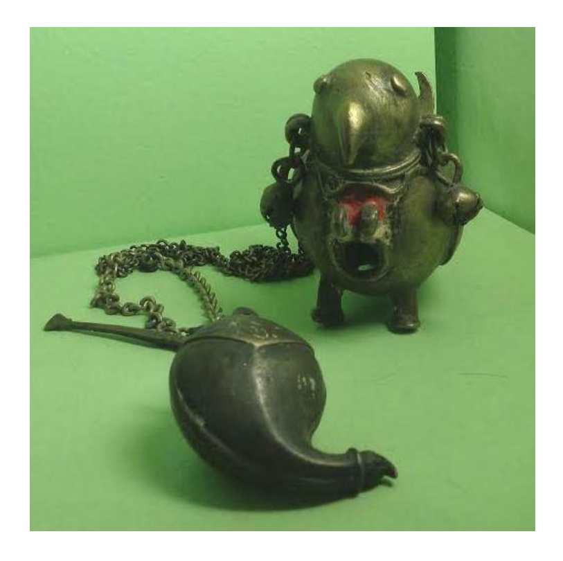
Fig. 4. Lime boxes, brass and copper, 18th–19th century, from Maharasthra, Raja Dinkar Kelkar Museum, Pune, India.