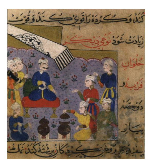
Fig. 4. Illustration from Ni'matnāma , 15th century Cookery Book. Sultan of Mandu watches preparation of aphrodisiac food (British Library IO Isl 149, f. 133b).