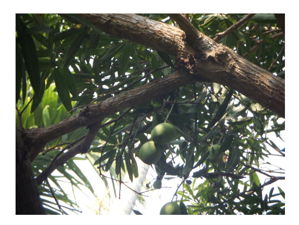
Fig. 1. Branches of mango tree with fruits.