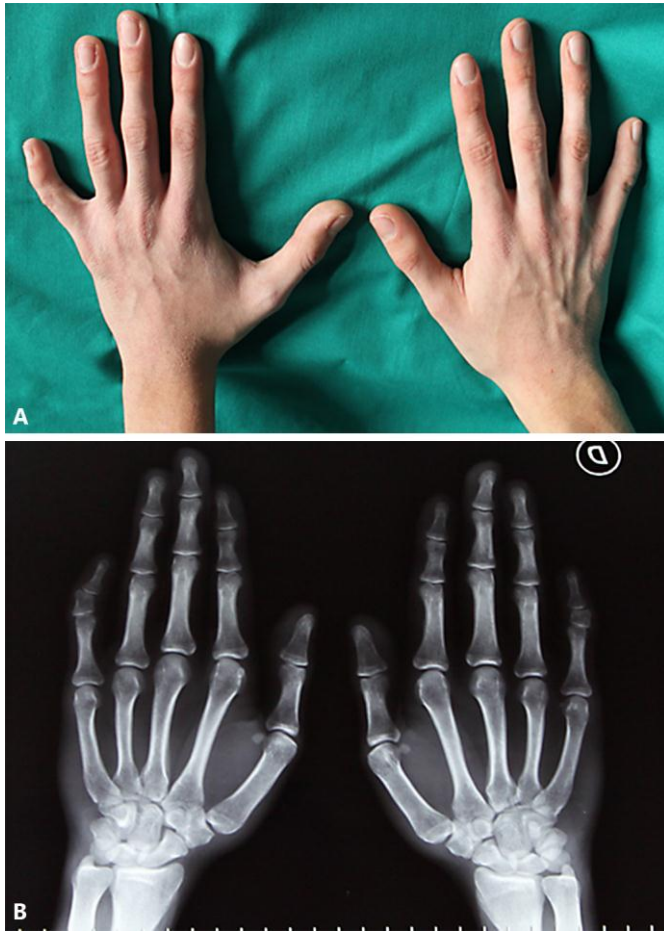
Fig. 3. The patient showed clinodactyly of the fifth finger of both hands (A), more evidently on the left side, confirmed by X-ray examination (B).