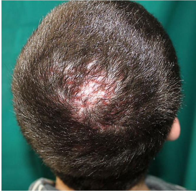
Fig. 2. Tufted hair folliculitis on the scalp, a patch of alopecia characterized by perifollicular erythema and follicular hyperkeratosis.