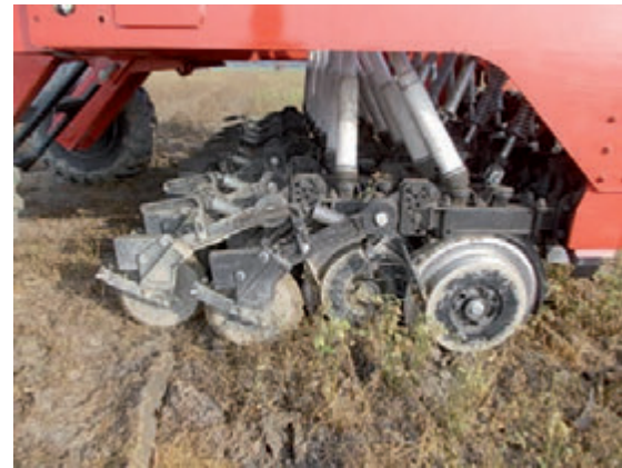
Figure 2. Seeding on alfalfa residues.

alfalfa) was the same, while the work efficiency was slightly higher for the trial over alfalfa: 1,04 ha/h compared to 0.99 ha/h (over corn). This was due probably to the sporadic blockage of the machine with crop residues (Figure 2). In both situations, however, the ability to work effectively deviates significantly from the theoretical one. This is due to drill size used on sod seeding, of drawn