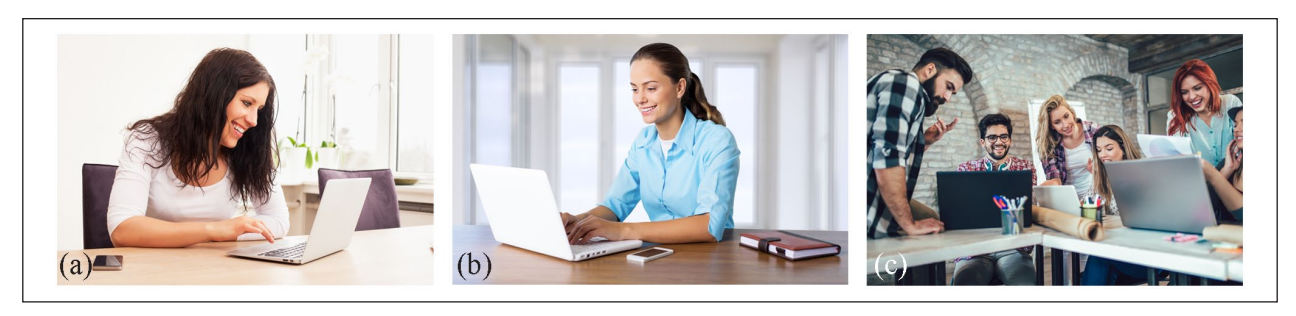
Figure 4. Selection of "affective flattening" photos.

clearly negative facial expression. Once again, the keywords used for tagging stock photos reflect the same affective bias: keywords such as smiling , enjoyment , happiness , cheerful , and happy were used abundantly, while sadness , unhappy , and angry occurred very rarely.