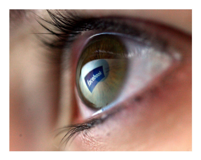
Figure 1. Picturing social media in the news—a typical example.

This image is in fact an example of what social semioticians would characterize as a conceptual image (Kress & van Leeuwen, 1996, p. 59): a stylized expression of a general idea or feeling (a "timeless essence") rather than a depiction of a specific event or detailed story. In Figure 1, we find a single commercial provider (Facebook) metonymically deployed to represent all social media platforms. The image itself in turn comes to stand for the general idea of "social media" rather than its specific uses and/or contexts of use. This is not to say that the image is devoid of meaning; indeed, we sense at least one meaning potential: social media fills the eye, consumes our vision, and penetrates the mind. Without verbal anchoring (cf. Barthes, 1972), the image, however, offers little in the way of immediate social context or interactional narrative.