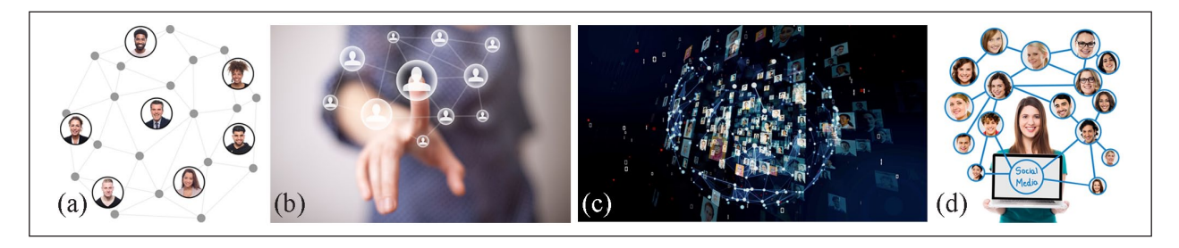
Figure 6. Selection of "desocialization" photos—connectivity over connection.

asocial or desocialized. To make the point just a little stronger, we turn to our final analytic move and another way in which sociality appears to often be eclipsed or at least obscured in stock photography.