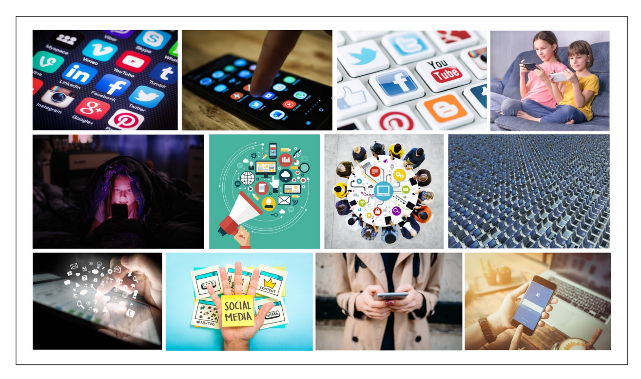
Figure 2. Montage of typical news-media images sourced from major image banks.

evidence (see Thurlow et al., 2020 for the kind of systematic, multi-coder content-analytic procedure used). To this end, we start by offering the montage of images in Figure 2, which gives an impression of how social media were typically depicted. As it happens, these particular examples have been deliberately drawn from the first news media dataset; as such, we have typical photos sourced from major commercial image banks and circulated further afield.