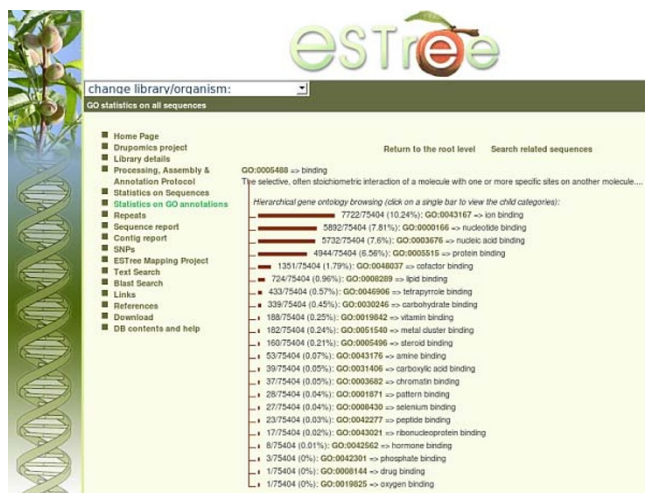
Figure 2 GO Statistics in the ESTree db. An example of a GO Statistics page in the ESTree db. Clicking on bars allows hierarchical ontologies browsing. Sequences matching each GO identifier are retrievable via the "Search related sequences" link.

The ESTate package programs [20] were used to deduce from each EST and contig consensus a putative protein sequence. FrameFinder uses log odds hexamer frequency statistics and multiple dynamic programming frame-shifts