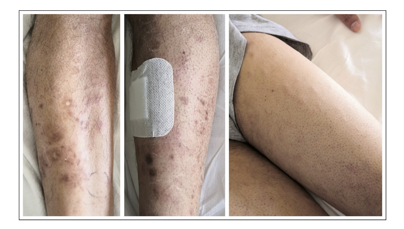
Figure 1. Maculopapular rash and erythematous nodules and plaques on the lower limbs.