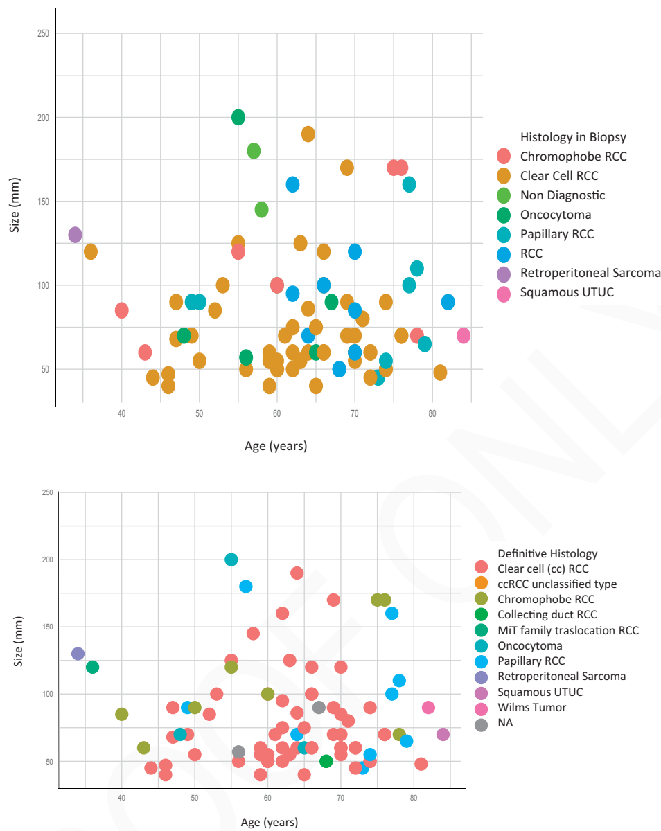
Figure 2. (a) and (b) Distribution of histological subtypes of renal biopsy and definitive specimen findings according to age and tumor size.

logistic regression models. The evolution of renal tumor biopsy techniques has shown how the increase in the number and supply of multi-quadrant samples allow the elimination of inconclusive histological cases and a crucial improvement in the characterization of grade in large renal masses [19]. In fact, a stratification of RCCs according to indolent and aggressive malignant behaviour, as previously described by Bhindi et al. [15,20], may permit a better tailored treatment even in larger renal masses. In our series, this stratification resulted in 50 cases of non-aggressive malignant histology and in eight of aggressive malignant histology, while, unfortunately, it remained undefined in 23. Unfortunately, neither size, stage nor core-biopsy needle (18 vs 16 gauge) associated with a better accuracy in definitive grade identification in multivariable logistic regression models.