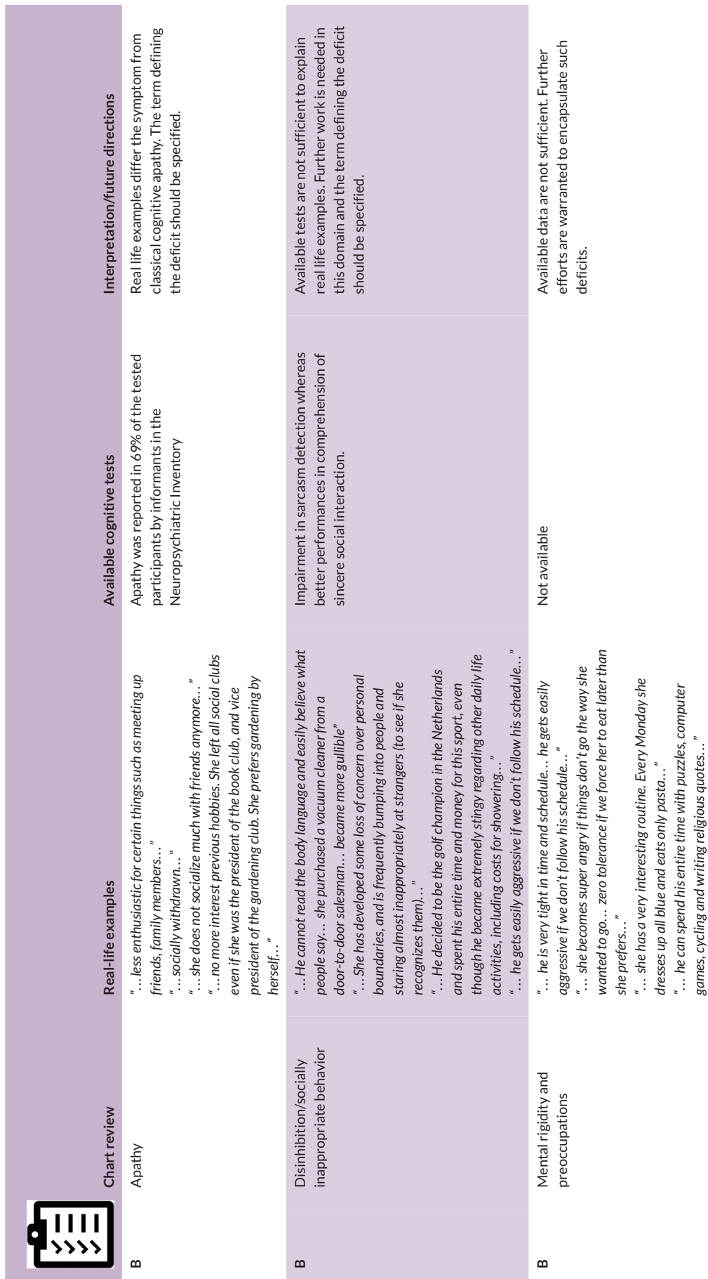
TABLE 4 (Continued)

Note: B: Symptom can be reported as a behavioral problem by the caregiver. L: Symptom can be reported as a language problem by the caregiver. M: Symptom can be reported as a memory problem by the caregiver.