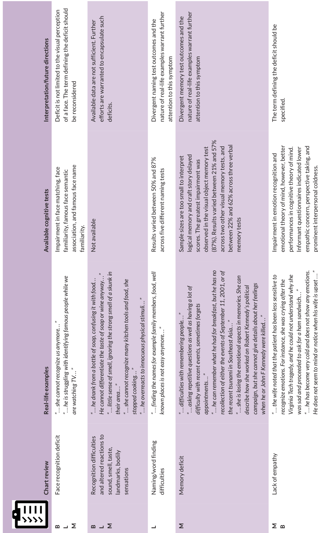
TABLE 4 Summary of the overall results and interpretation