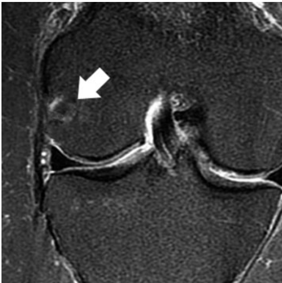
Fig. 2 T2-weighted MR scan with hypointense core plus hyperintense surrounding the lesion (arrow). MR, magnetic resonance.

The patient underwent a surgical LFC curettage and synovectomy with synovial biopsy that was found to be inflamed and hypertrophied with multiple “rice bodies” (► Fig. 3 ). The histopathologic exam revealed granulomatous inflammation with caseous necrosis, suggestive of TB. Polymerase chain reaction (PCR) test for Mycobacterium tuberculosis DNA was positive, resulting in an isoniazid monoresistance profile. The patient was treated with a polytherapy consisting of rifampin, pyrazinamide, and