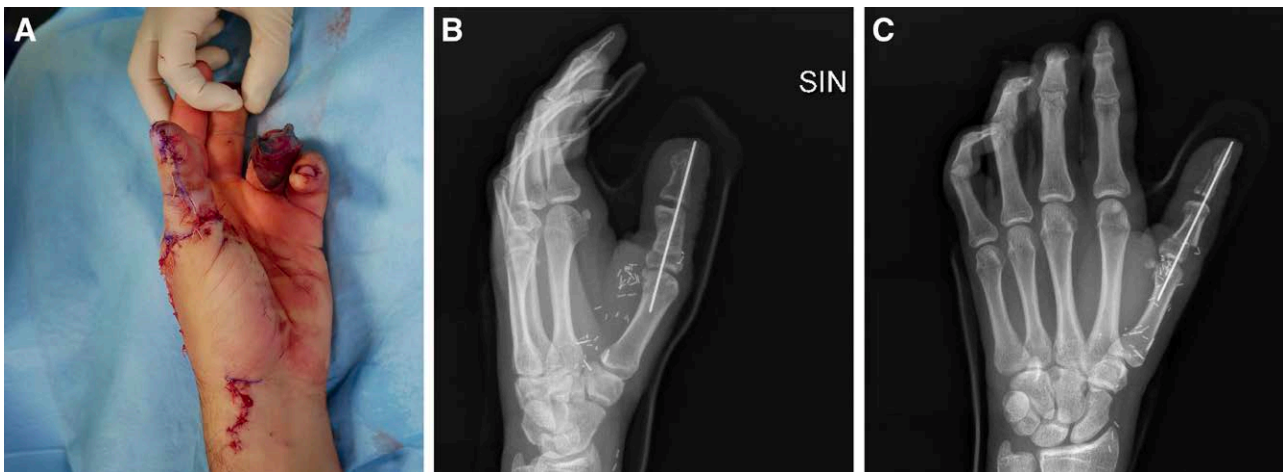
Fig. 4. A, TGT flap inset immediate postoperative. B and C, Rx after the inset of the flap.