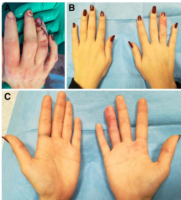
Fig. 2. A, Flap inset immediate postoperative. B and C, Follow-up after 3 months.

digital collateral arteries. In one case, we used the arterial branch for the second toe as a flow through to revascularize a superficial iliac perforator flap, which was needed to cover the second and third metacarpal bones left exposed by the trauma. In all patients, a superficial dorsal vein of the foot was used as a donor vessel, anastomosed to superficial veins of the hand of appropriate size.