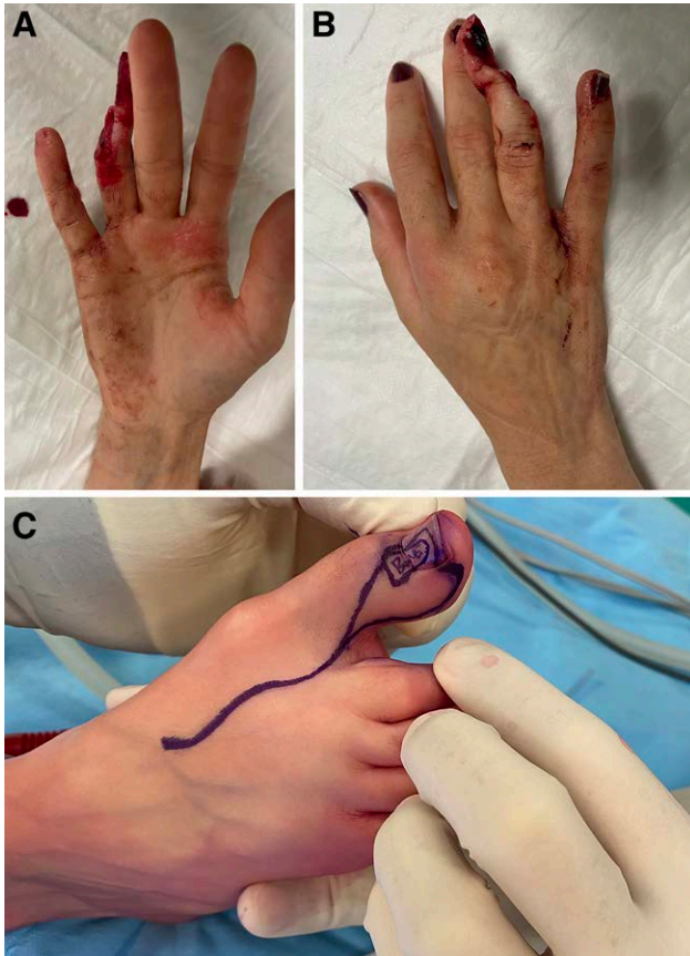
Fig. 1. A 21-year-old female patient with an oblique amputation of fourth digit after trauma. A and B, Preoperative photographs. C, Design of the flap.