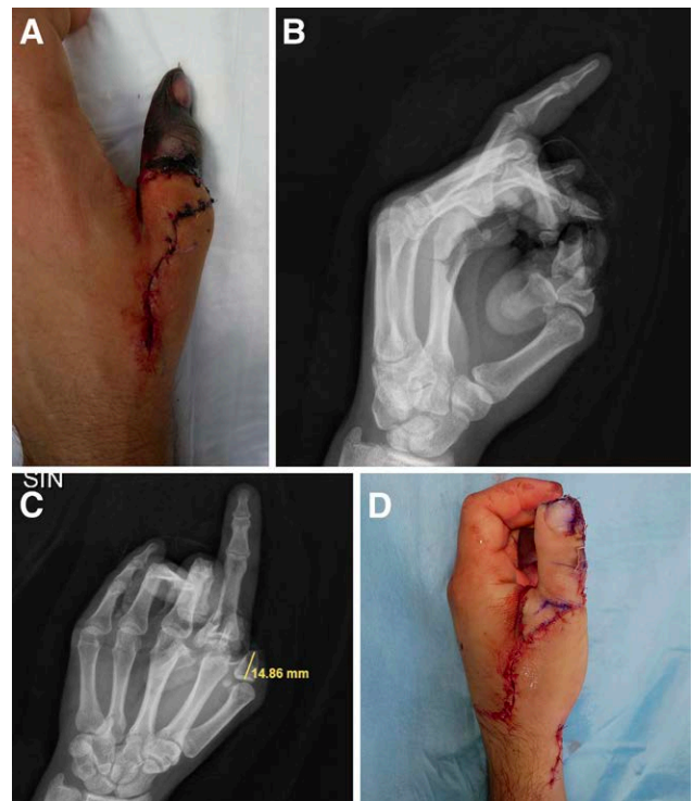
Fig. 3. A, A 28-year-old male patient with a replant failure of left thumb after trauma. B and C, Rx of the defect. D, TGT flap inset immediate postoperative.

Our data have highlighted, once again, the TGT as an aesthetically valid reconstructive option for digit amputations and led to new perspectives in the literature for its application in long finger defect reconstruction. We believe that meticulous preoperative measurements, attention to detail, and a clear reconstructive plan are essential to achieve the best aesthetic outcome. In our