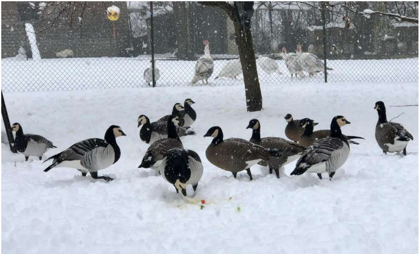
Figure 1. Group of Minor Canadian geese ( Branta hutchinsii ), Barred head geese ( Anser indicus ) and White-faced geese ( Brenta leucopsis ).

another aviary cage, divided by species or groups of species, compatible in character and reproductive period. In other aviary cages, different poultry breeds were reared. Each group of animals had a pond at his disposal, where the water was changed every 30 days, without added chlorine, and meadow for scratching. The reproduction occurs naturally between April and May, followed by the hatching, and each couple takes care of their goslings independently. The average spring, summer, autumn and winter temperatures ranged around +8/+15 °C, +28/+35 °C, +5/+20 °C and 0/−20 °C, respectively.