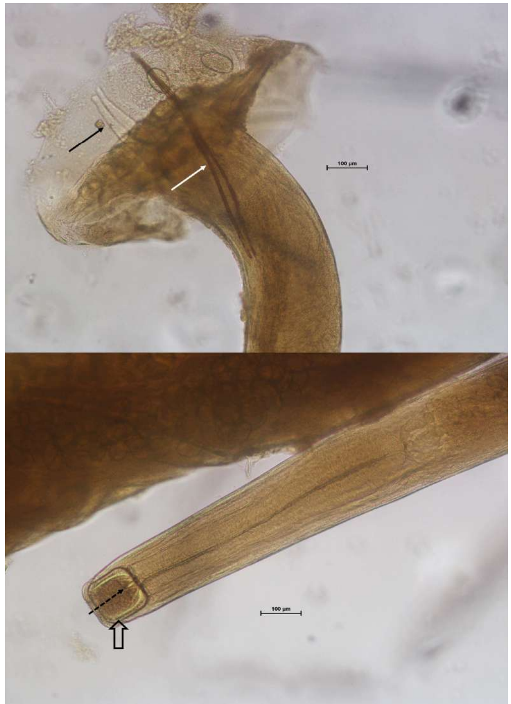
Figure 3. Microscopic view of the tail and head of C. bronchialis male. Black arrow: branched dorsal ray; white arrow: spicules; empty arrow: buccal capsule; dotted arrow: buccal teeth. Unit is 100 \mu\text{m} .

The parasites collected were identified as C. bronchialis . Besides tracheal localization, the main features useful for the identification were: males smaller than females; males and females not strictly joint in copula; buccal capsule that was large and heavily walled with teeth of different sizes at the base; male with strongyliform bursa with dorsal ray branched; spicules more than 400 \mu\text{m} long (range 620–680 \mu\text{m} ) (Figure 3); and the female vulva near the anterior third of the body.