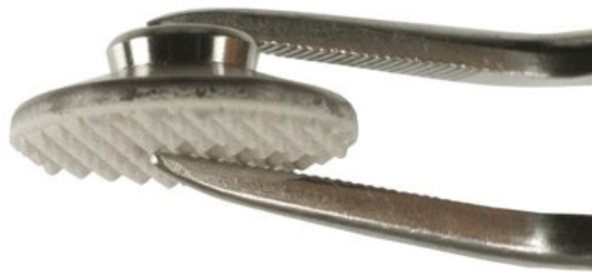
Figure 1. An Onplant device (Nobel Biocare, Gothenburg, Sweden).

Even though the onplants are no longer available on the market, clinical and biological advantages of subperiosteal implants should be considered in the development of new types of absolute anchorage to provide clinicians with a safer technique compared to palatal short implants or orthodontic miniscrews. Therefore, the purpose of this narrative review is to offer the reader an overview of this type of skeletal anchorage that, although no longer available, represents a starting point for its use in orthodontics, especially in the most critical patients in whom the use of miniscrews is not recommended.