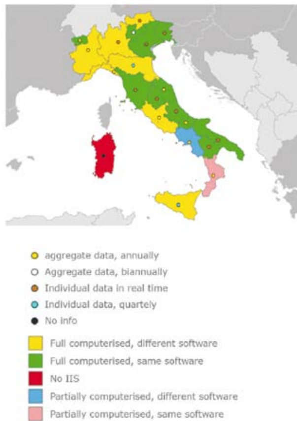
Fig. 1 - Existence and characteristics of the Regional RIRs in Italy, by Region, 2017

2014 - for all children and children at risk respectively - by antigen. Data availability is presented both for vaccine-preventable diseases targeted in the 2012-2014 NIP (Measles, Mumps, Rubella, Meningococcal C, Varicella, Pneumococcal) and for those not yet targeted (Rotavirus, Meningococcal B, Meningococcal ACWY).