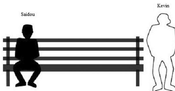
Fig. 1. Image 1 from the SEBT (UK version).