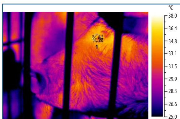
Figure 1. Thermal image of a pig's head showing the position of the measurement point on the eye.

Thermal images of the eye of each animal were recorded with a thermal imaging camera (Nec Avio TVS500). To optimize the accuracy of the thermographic image and to reduce sources of noise, before every work session the same image of a Lambert surface was taken to define the radiance emission and to nullify the effect of surface reflections on tested animals (Mallick et al. 2005). Only perfectly focused images were used. To determine the temperature of the eye, Grayess IRT Analyzer 4.8 (Informer Technologies, Inc., USA) was used and the maximum temperature (°C) within a circular area traced around the curuncula lacrimalis was measured (Figure 1). This maximum value was used for subsequent analysis. Rectal temperatures were measured using a calibrated digital thermometer, checked before the examination and compared to a certified mercury thermometer. In accordance with the manufacturer's instructions, the thermometer was inserted into the anus and positioned in contact with rectal mucosa for 10 seconds, until hearing the acoustic signal. During the measurements, animals were not manually restrained. For each animal the capture of thermal image was immediately followed by the measurement of rectal temperature; temperatures were recorded at the same time