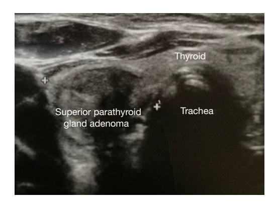
Figure 1 Ultrasound image of parathyroid adenoma.