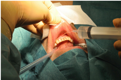
Figure 2 Disinfection of the oral cavity.