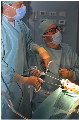
Figure 1 Operative room setting. The 1st assistant is important, he helps to hold correctly the camera. The first assistance is key person to help endoscopic surgery become a success and send at surgeon left.