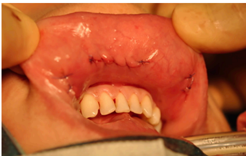
Figure 3 Outcome of the 3 vestibular incision.