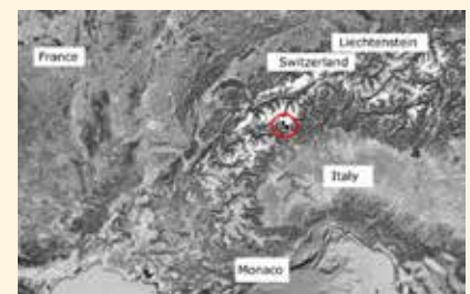
Location of the Lys and Verra Grande glaciers forefields. Northwestern Italian Alps (Michele D'Amico)