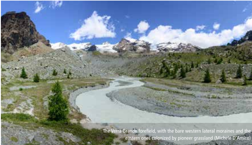
The Verra Grande forefield, with the bare western lateral moraines and the eastern ones colonized by pioneer grassland

Despite the short distance from the Lys forefield, the Verra Grande forefield has a very different appearance. The western part of the LIA moraine system is almost devoid of vegetation: only a few trees and shrubs grow on bare soil. The eastern part is more vegetated, but the ground is covered by pioneer grassland species, with only a few scattered larch trees. Only limited flat and particularly stable surfaces have larch forests. The typical subalpine vegetation is developed on older surfaces.