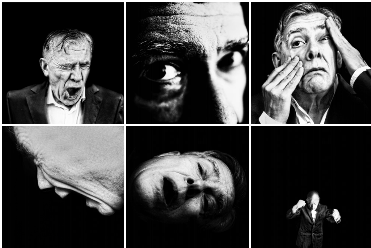
Figure 1-6. From: Jeu de 54 cartes , 2017. Digital pigmented print on Arches paper 640g/m 2 .152 cm x 102 cm (96 cm x 96 cm).

And artists are similar, they do the same things, they also create illusions. They use things to show other things. Here, too, we have a divide: photography is something so vast that it doesn't make sense to refer to it here. I'm referring to my work, since in my work I use a pathway, a certain way in which photography involves a system of transformations—transformations from what I use to what I get. There is an American song I am very fond of that I think, in a sense, describes my way of working and of thinking as well: I'm gonna use what I got to get what I need .