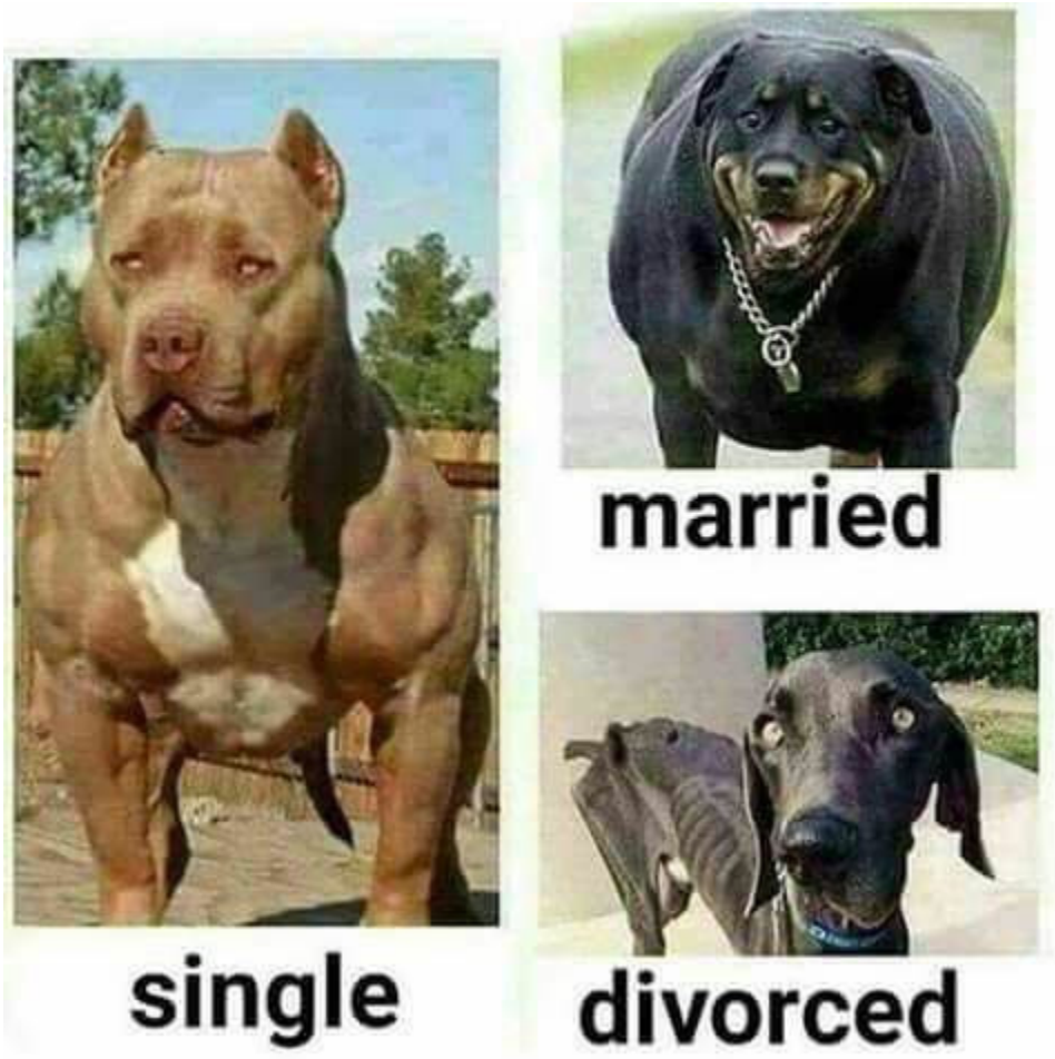
Vignette representing divorced women's greediness

1 2 3 4 5 6 7 8 9 10 11 12 13 14 15 16 17 18 19 20 21 22 23 24 25 26 27 28 29 30 31 32 33 34 35 36 37 38 39 40 41 42 43 44 45 46 47 48 49 50 51 52 53 54 55 56 57 58 59 60