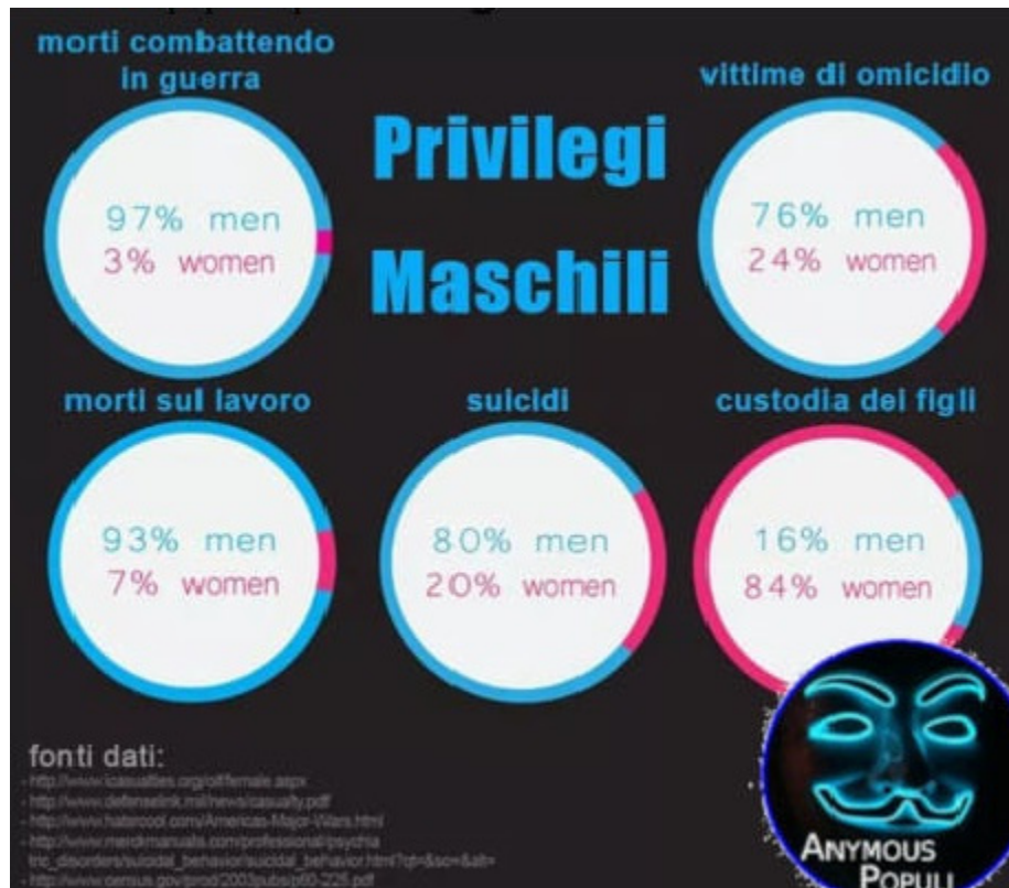
Ironical vignette on men's privileges