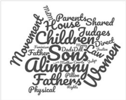
Word cloud of keywords emerged by the web scraping on Mantenimento Diretto Facebook page (translated from Italian to English)

1 2 3 4 5 6 7 8 9 10 11 12 13 14 15 16 17 18 19 20 21 22 23 24 25 26 27 28 29 30 31 32 33 34 35 36 37 38 39 40 41 42 43 44 45 46 47 48 49 50 51 52 53 54 55 56 57 58 59 60