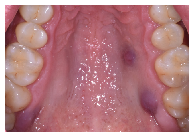
Fig. 1. Occlusal view of three painless, red-purplish, papular and nodular lesions of the hard-palate mucosa.

Involvement of the oral cavity occurs in up to 71% of AIDS-related KS cases and oral KS manifestations appear as initial sign of the disease in 22% of them [1–3]. Epidemic oral KS have a wide range of clinical presentation which may vary from slow-to fast-growing masses [1]. The first oral signs may appear as ecchymotic patches which evolve to papular, nodular, and exophytic lesions presenting a color that can vary from dark reddish to purplish blue [1,2]. The most frequent affected intra-oral sites are the hard-palatal mucosa (50%) and the