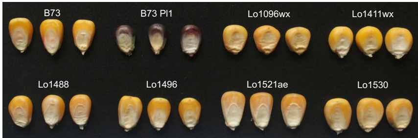
Figure 1. Representative image of kernels of the eight maize inbred lines.

accumulation of anthocyanin pigment in different plant organs, such as seed pericarp, anthers and leaves. The Lo1411wx and Lo1096wx lines carry defective alleles of the waxy gene encoding a granule-bound starch synthase. Mutations at the waxy locus eliminate amylose synthesis, resulting in 100% amylopectin in the endosperm (Tsai, 1974; Wessler and Varagona, 1985).