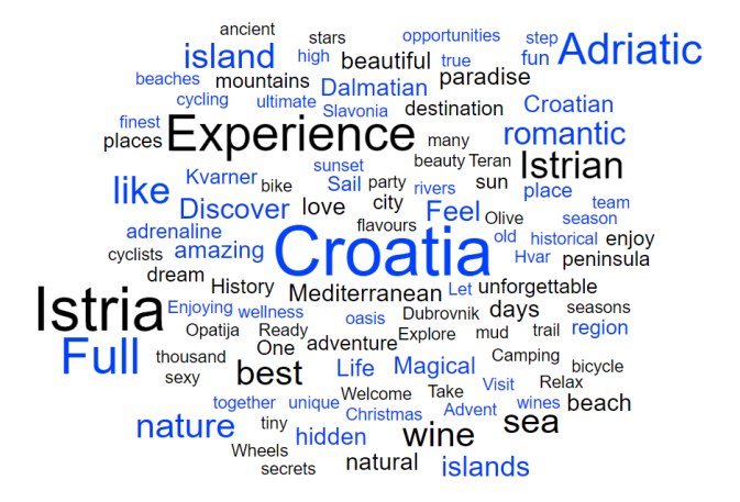
Figure 2: Wordcloud of the usage frequency of the words

Further, Wordcloud was used to better visualize the most frequent words. The greater the usage frequency of a word, the larger its presence in the wordcloud.