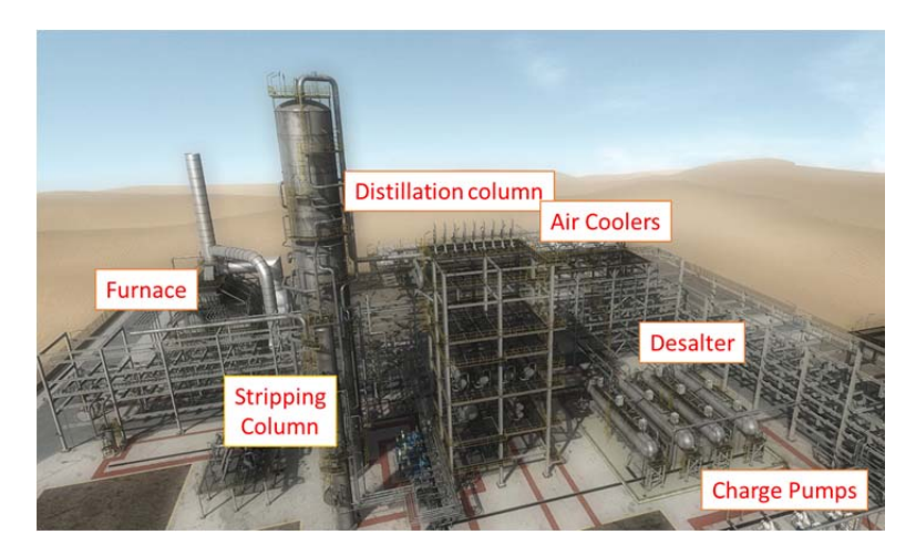
Figure 1: Virtual Crude Distillation Unit overview with the indication of the main units.

The virtual Crude Distillation Unit is able to process 170.000 BPSD (Barrel Per Stream Day, equal to1130 m^3/h ) of crude. Two parallel crude preheat trains, two desalter units in each train, one pre-flash drum, one crude charge heater and the crude column section are the main units present in the plant. The crude oil is separated in off gas, wild naphtha, kerosene, light gas oil, heavy gas oil and atmospheric residue. The detailed description of the plant is reported elsewhere (Pirola, 2020), while the general overview of the plant is shown in Figure 1.