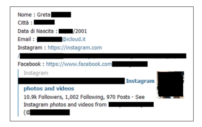
Figure I. A bot on Telegram.

Categorization and objectification practices are also evident in the analysis of bots. As previously outlined, bots are used